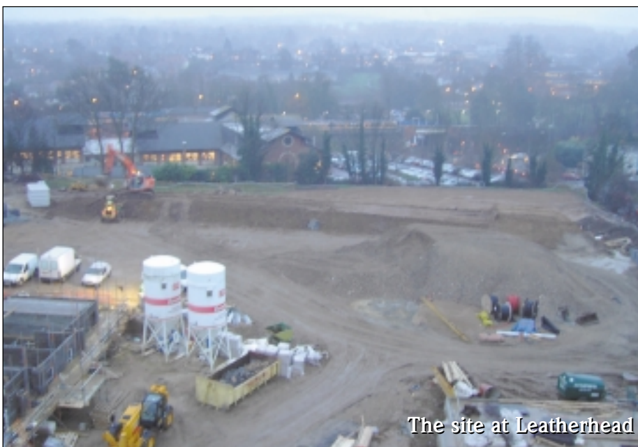
The site at Leatherhead